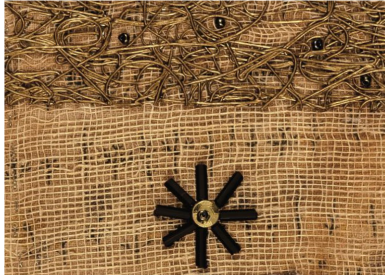
DETAIL ABOVE Black seed beads rain lashon hara down from the heavens while at the same time the black bugle beads carry the lashon hara towards the heavens.