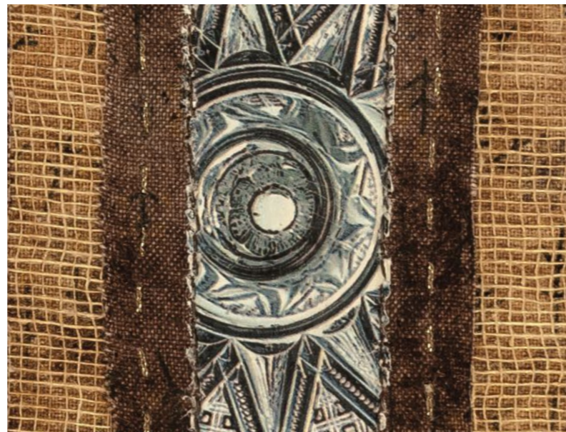
DETAIL RIGHT The paper collage represents the purity of the soul before being tarnished by lashon hara